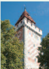
Gemalter Turm (Painted Tower)

The tower can be climbed between 4 April and 4 October every day from 11 am to 4 pm.