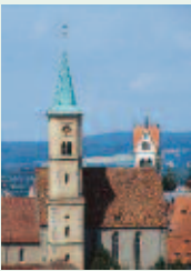
Evangelische Stadtkirche (Protestant church)

Grain from all over Upper Swabia was traded in the municipal corn house, called the "Schranne", up to the 20th century. Today, the building that dates back to 1451/1452 houses the town library.