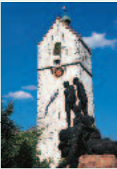
Untertor (Lower Gate)

The Untertor was built in 1363 as part of the town's fortifications. Like the Frauentor, this gate has a machicolation to defend it against attacks.