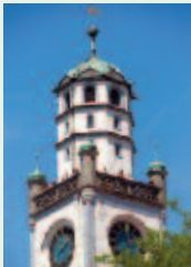
Blaserturm (Trumpeter's Tower)

The tower can be climbed between 4 April and 4 October every day from 11 am to 4 pm.