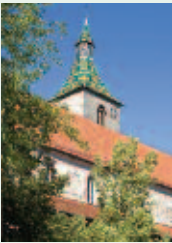
Church of St. Jodok

This church was built by the city of Ravensburg and Weißenau Monastery as a parish church in 1385. The unplastered, three-nave basilica has retained its original character even today.