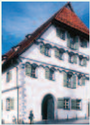
Kornhaus (Corn House)

Grain from all over Upper Swabia was traded in the municipal corn house, called the "Schranne", up to the 20th century. Today, the building that dates back to 1451/1452 houses the town library.